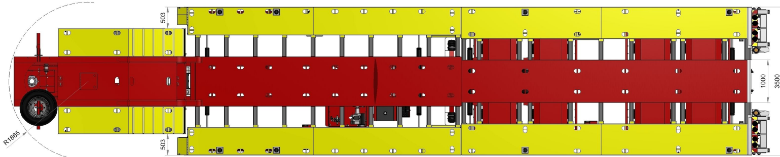
TOP VIEW OF TRAILER ADAM HEWES - ADH PLUMBING PTY LTD